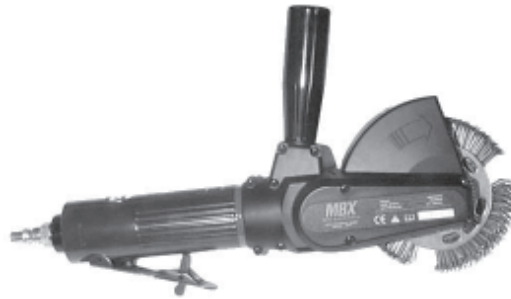
#7400 MBX Metal Blaster Pneumatic Tool